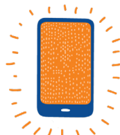
By Phone at 844-330-2020