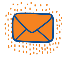
By Mail Complete and return your Census form!

All communities deserve the opportunity to thrive and provide for their families.