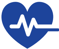
HEALTHCARE FACILITIES & EMERGENCY SERVICES

The Census provides billions of dollars to help support key community services, including: