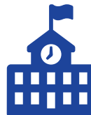
HOUSING AND EDUCATION PROGRAMS