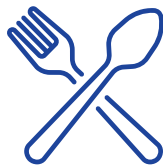
CHILDREN'S NUTRITIONAL PROGRAMS