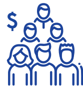
ECONOMIC DEVELOPMENT AND JOBS CREATION

Californians can help achieve a complete count by participating in one of three ways: